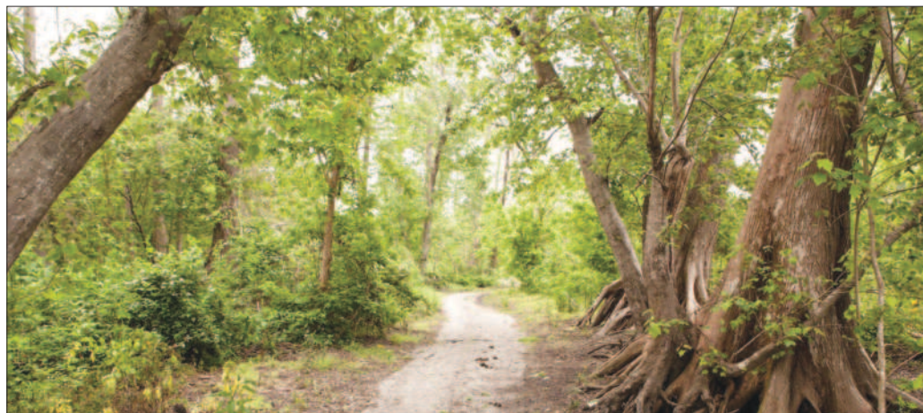
Woodlands Conservancy was organized as a nonprofit land trust organization in 2001 to preserve and restore remaining forested wetlands and other ecologically or historically significant lands in Louisiana.