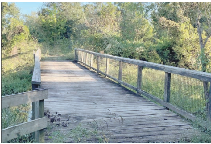
Before the bridge re-decking.